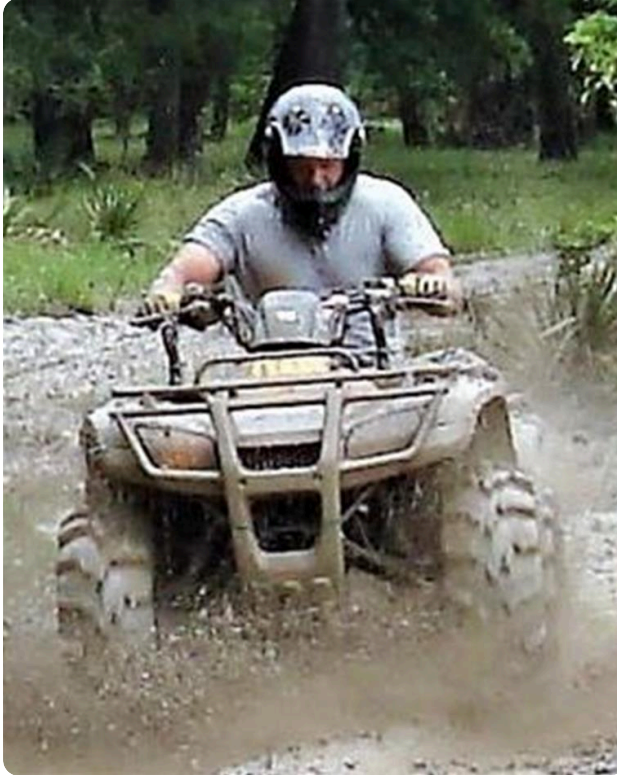
He loved the great outdoors!